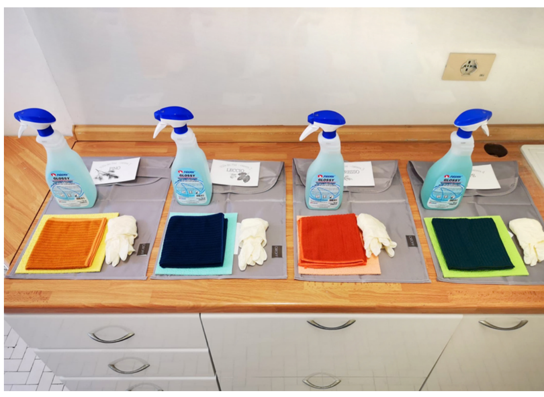
Color-coded cleaning kits for our Fellows